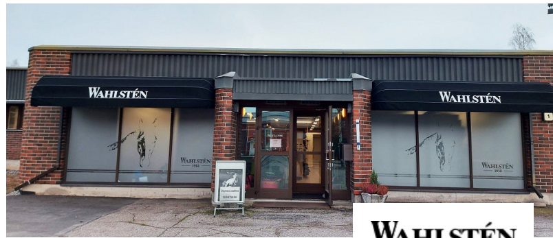
Wahlstén factory shop, Lahti