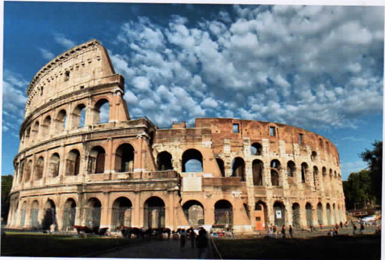
Rome: personalized visit to the Coliseum