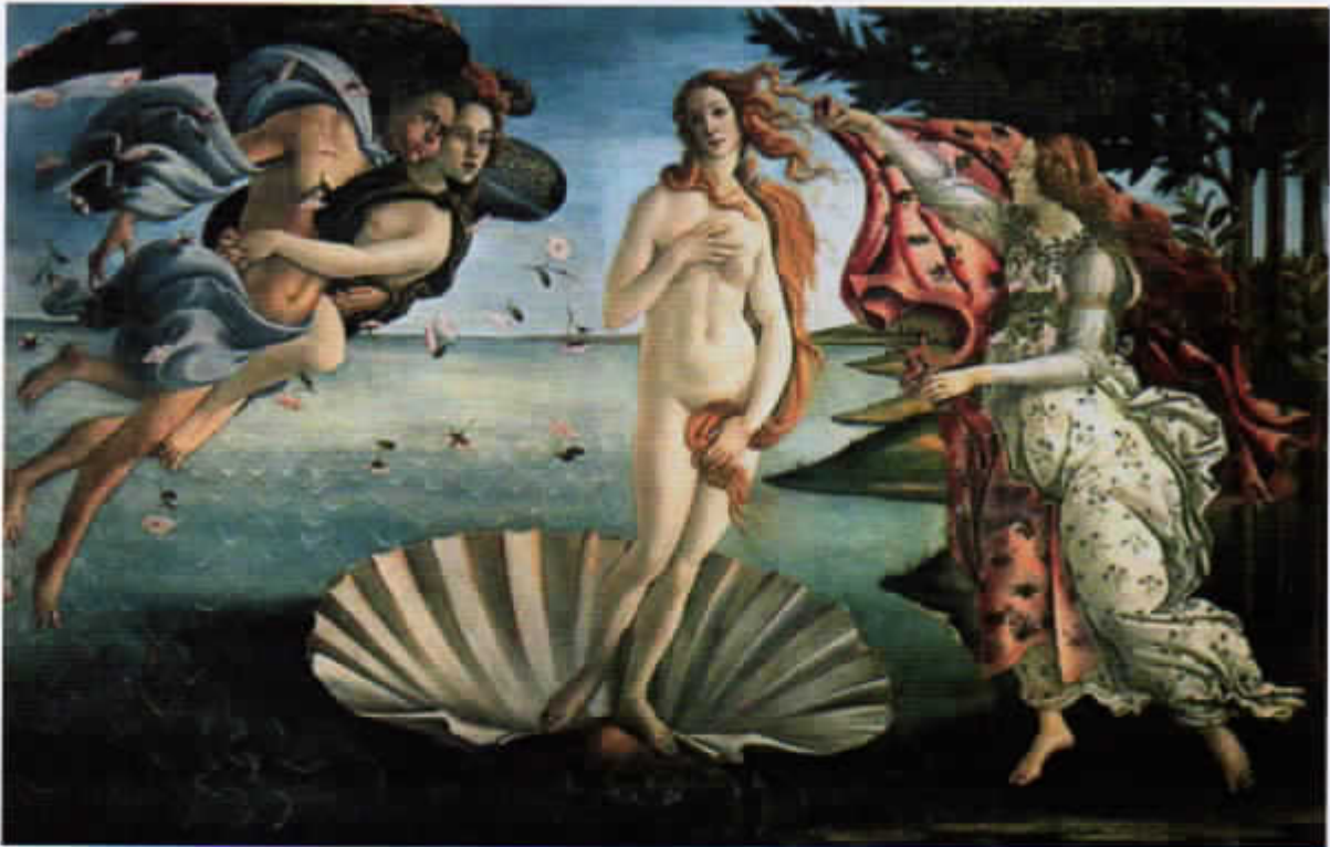
The most famous painting in the world: "The Birth of Venus" . At the Uffizi Museum in Florence we will be received by the Authorities, outside the closing time, in front of the original by Sandro Botticelli