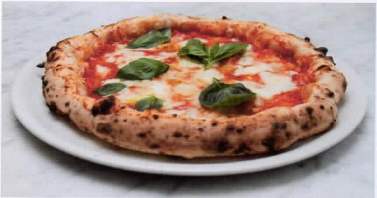
The Museum of the "true" pizza