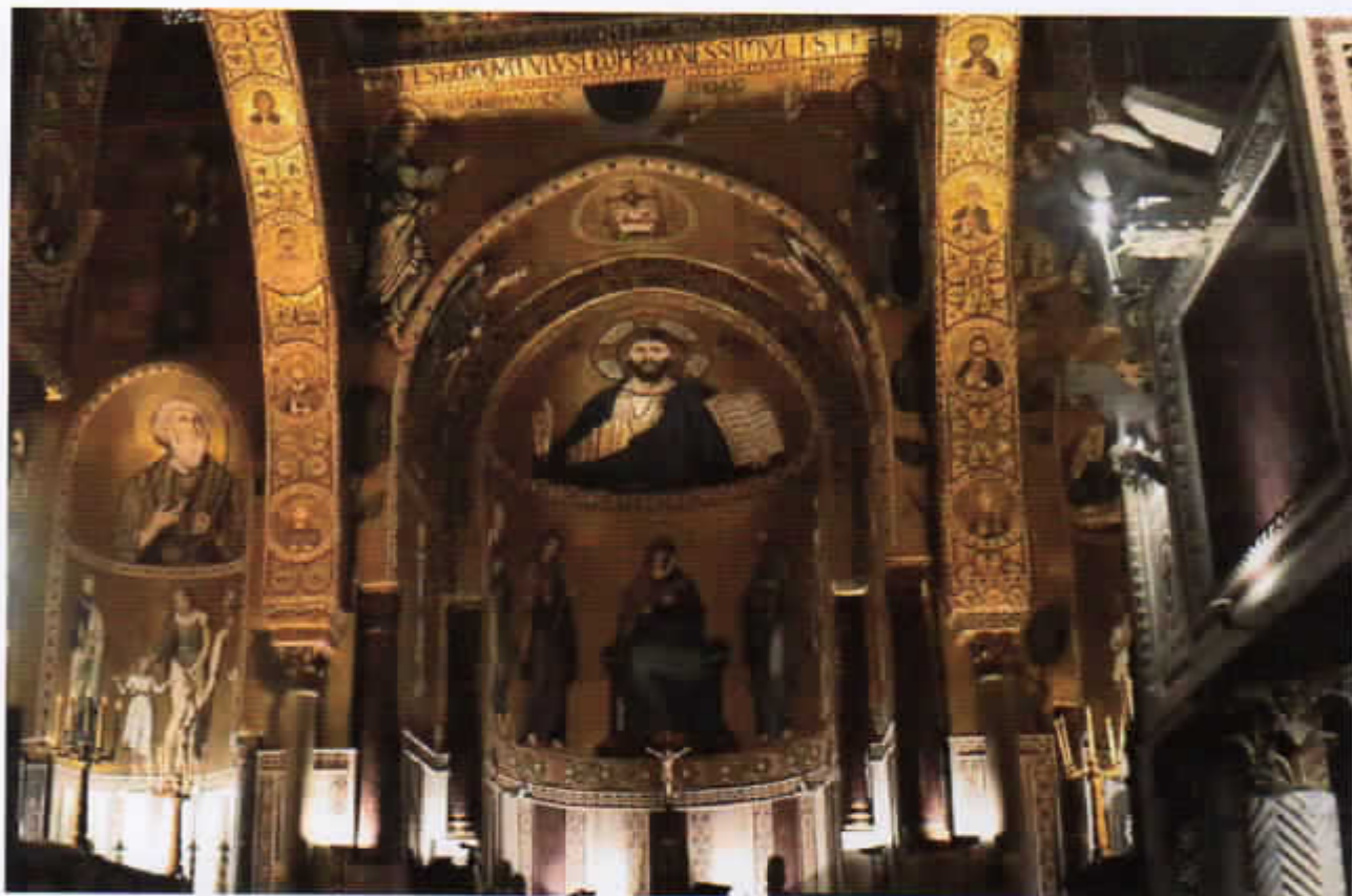
Monreale, Palermo, Sicily