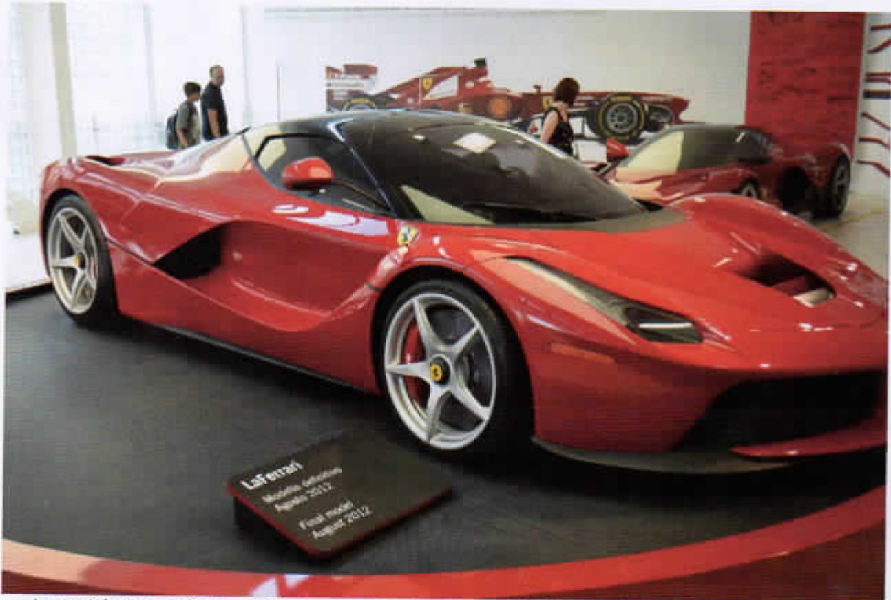
A special visit to the Ferrari factory and racing team, with the possibility of drive-testing some legendary cars on the Fiorano company circuit (Modena, Emilia, Italy)