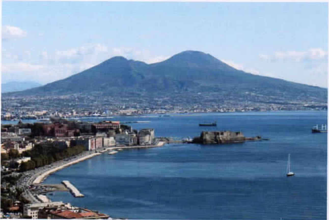
The magic of Naples