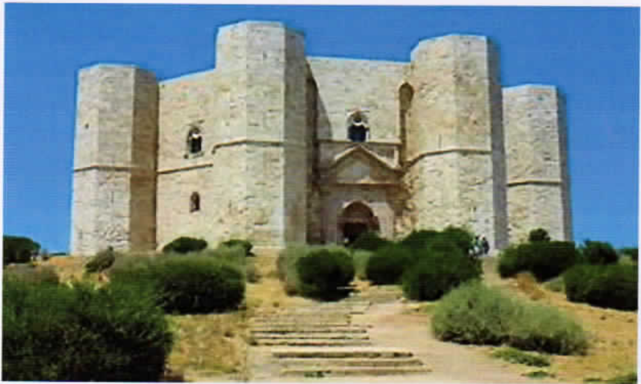
Castel del Monte, the most beautiful civil building and architectural masterpiece in the world !