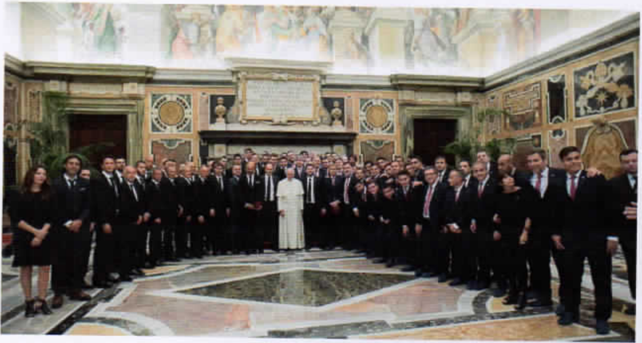
Rome: in reserved audience by Pope Francis