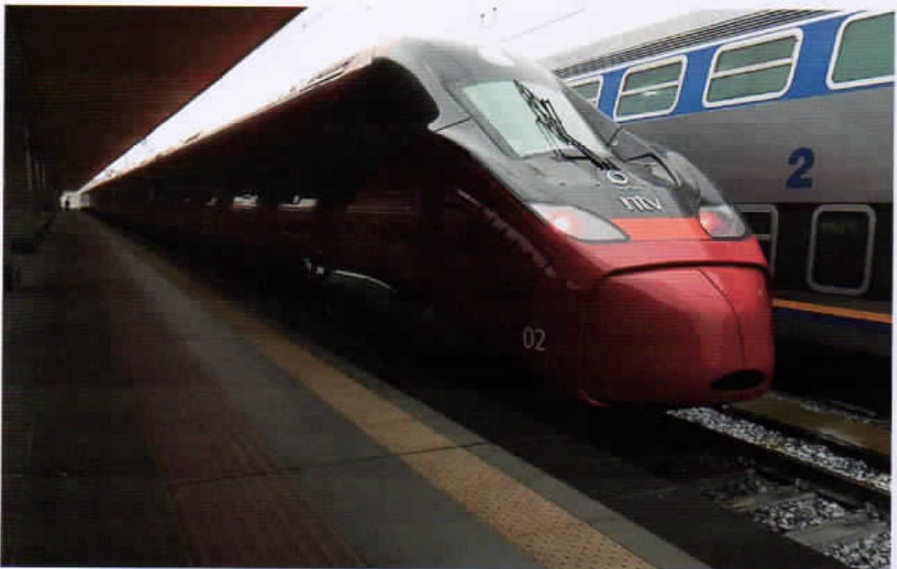
NTV Italo Train: an exclusive journey from Naples to Rome, from Rome to Turin, from Turin to Florence, from Florence to Venice