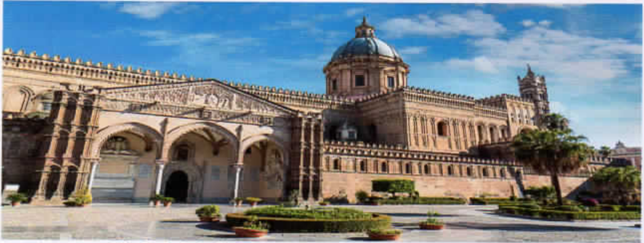
The Cathedral of Palermo, with the tomb of Emperor Frederick II