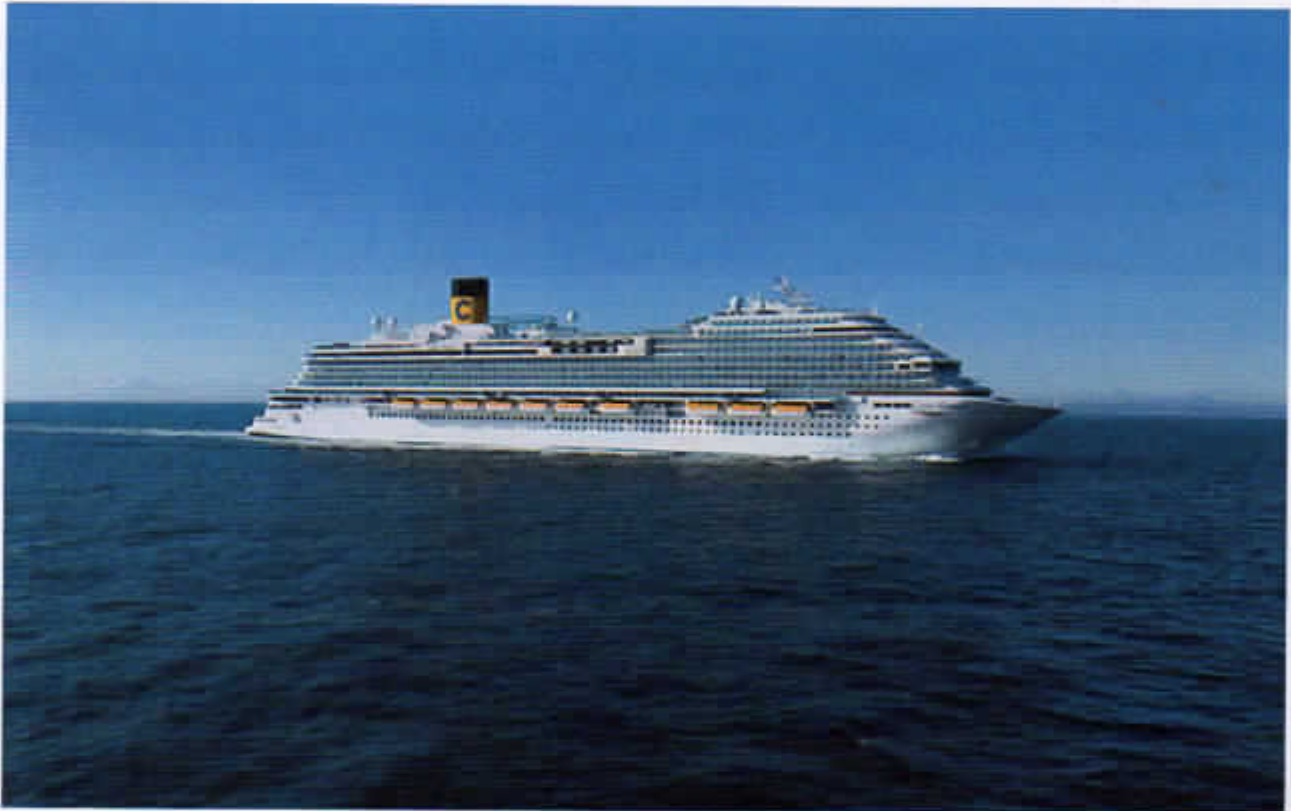
Gala Dinner & Dance during a spectacular transfer by ship from Palermo to Naples